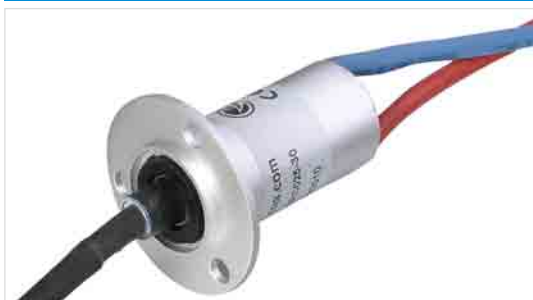
标准型(Standard Type) SRC025-30